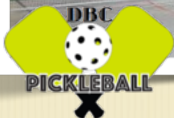
Action on the courts ....