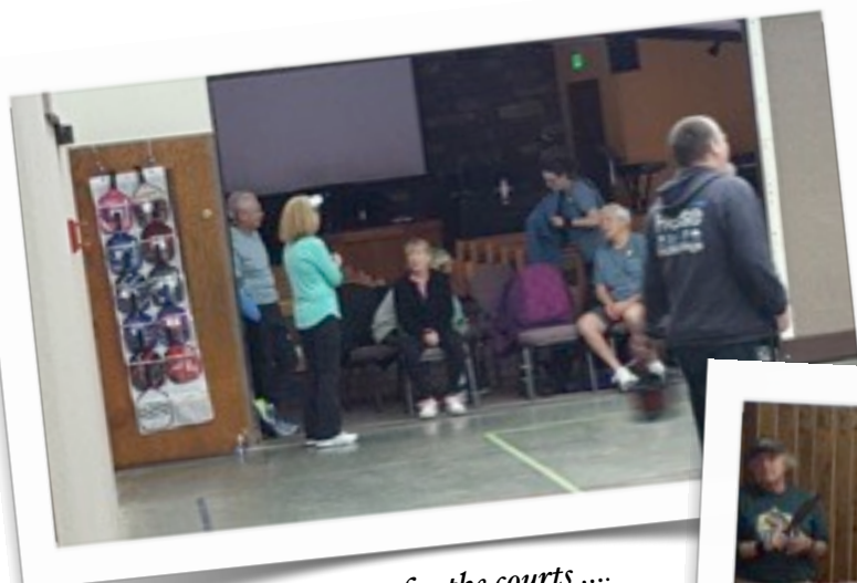
Lots of paddles waiting for the courts ....

Around 19 players attended the event - great turnout - thanks everyone for your participation!!